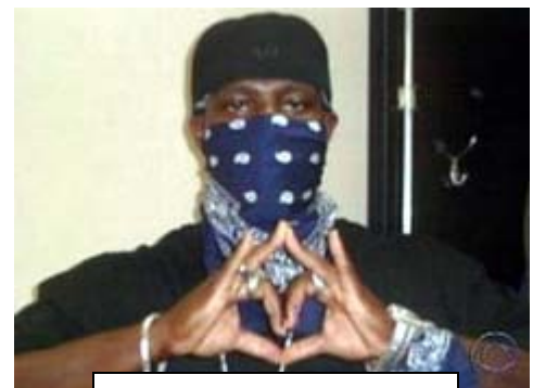
Four U.S. Marines in South Carolina were recruiting local kids into the Crips street gang.

(U//LES) Members of almost every major street gang have been identified on domestic and international military installations. The exact number is unknown because there are many members who conceal their affiliation. It is believed that street gang members join the military to take advantage of military training in weapons, convoy, and combat. After leaving the military, the gang members are equipped to use military tactics against Law Enforcement and rival gangs. There have been many criminal activities associated with gang members in the military. They include robberies, assaults, drug distribution, vandalism, money laundering, weapons violations, domestic disturbances, and drive-by shootings. Many of these members have slipped through the screening process by failing to report past criminal history and using fraudulent documents. Some enter as juveniles whose criminal history is sealed and not allowed to be viewed by recruiters. According to an open source article, the House of Representatives has passed legislation prohibiting service members from associating with street gangs. There is also a push to raise enlistment standards. To date one – in - ten new Army recruits have a criminal record. (CBS News, National Gang Intelligence Center)